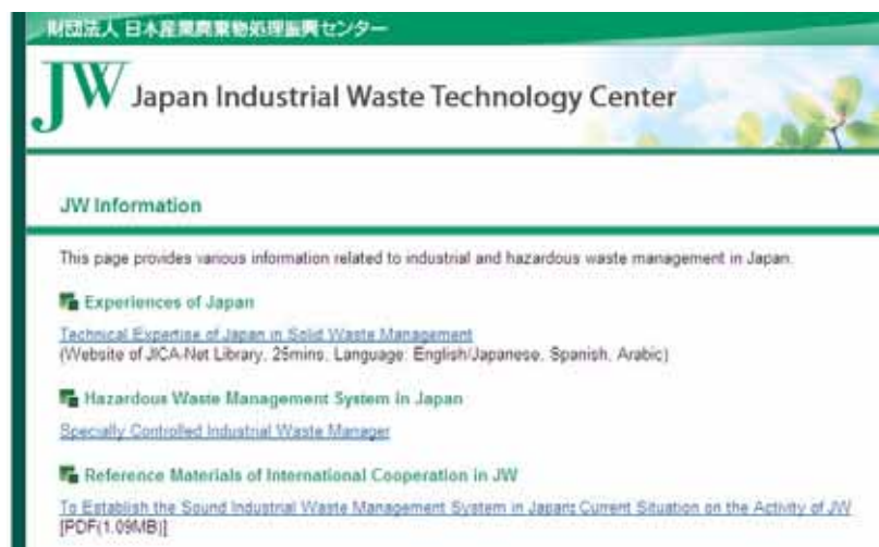
Fig.1 JW homepage English site [JW Information]

JW put up the English page in its homepage (Fig.1) in March 2010 and provides information related to waste management in Japan thus far. JW will further enrich it by uploading the above listed information and others steadily.