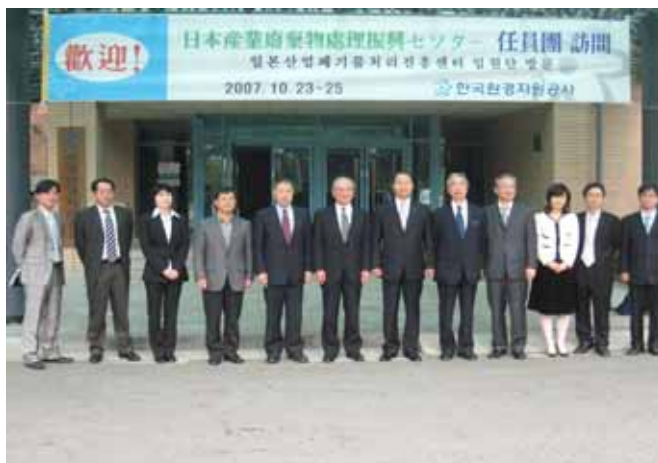
Photo.1 Attendees in the ceremony of MOU signing at ENVICO

Through building up such a bilateral relation with a certain entity of each country, JW will form a network for the promoting overall interchange on waste management in Asia.