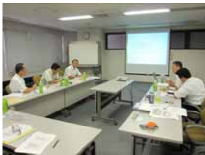
Photo.2 Information exchange session with the members of NCSWM